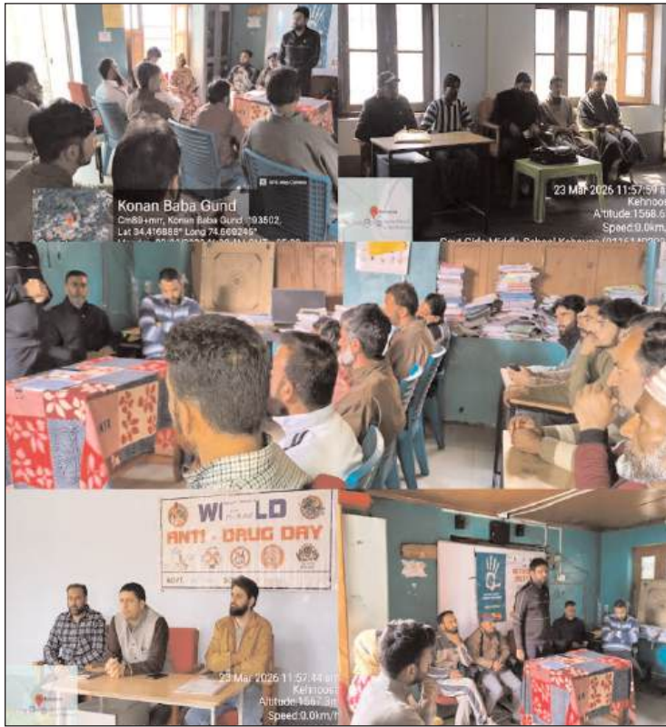
The importance of community participation and awareness at the

During the sessions, the resource persons delivered awareness lectures on various public welfare themes and highlighted